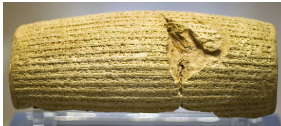
Cyrus Cylinder: discovered 1879 at Esagila temple in Babylon, now at The British Museum