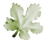
Leaves of Southwell