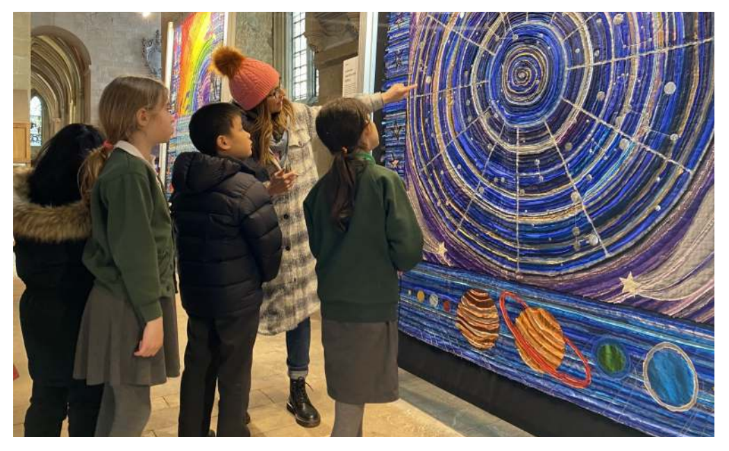
Photo: Children visit the 'Threads Through Creation' art exhibition, 2022

Religion and Daily Life: what does it mean to be a Christian? Celebrations & festivals, charitable giving, worship & community. How does faith translate into actions in the world?