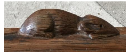
These mice are Victorian, carved into some of our furniture

When pilgrims leave, they usually take a souvenir home. You will make something to keep, and we will give you a ' journal ' as a reminder of your pilgrimage. The Minster is a big, beautiful, building with lots of amazing things to see – from enormous arches to tiny carved mice....like this one.