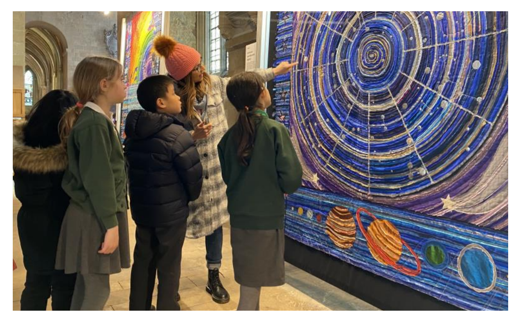
Photo: Children visit the 'Threads Through Creation' art exhibition.

Journey of Life / Remembrance : explore how rites of passage (birth, marriage, death) are marked in a church. Discover how and why the Minster is a place of public and private remembrance and what makes it special.