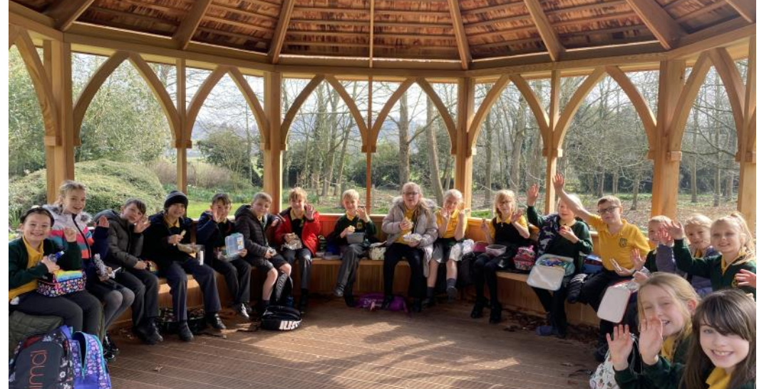
'It was lovely to sit in the garden in the sunshine enjoying our lunch!' (KS2 Teacher 2023)