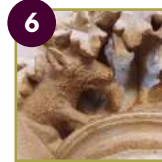
6 Hidden Pigs