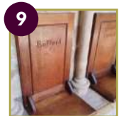
9 Prebendary Seats