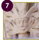
7 Lady Oak