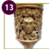
13 100th Anniversary Leaves Cup