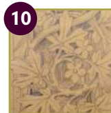
10 Simpson Pews – Sketches