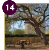
14 Mighty Oak and Boar