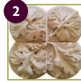
2 The Leaves of Southwell