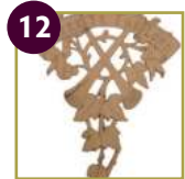
12 Simpson Pews – Templates