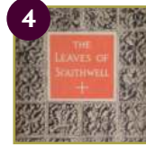
4 Pevsner's 'The Leaves of Southwell'