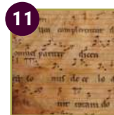
11 Medieval Music