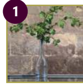
1 Living Leaves of Southwell