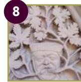
8 Green Man