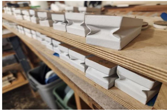
New leather on Roosevelt motors