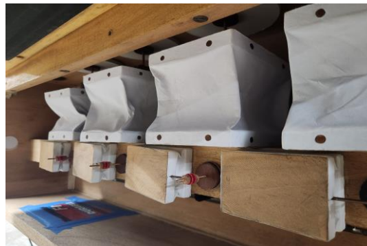
Ventil stop actions