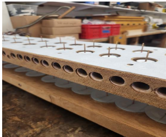
Newly restored soundboard key primary action